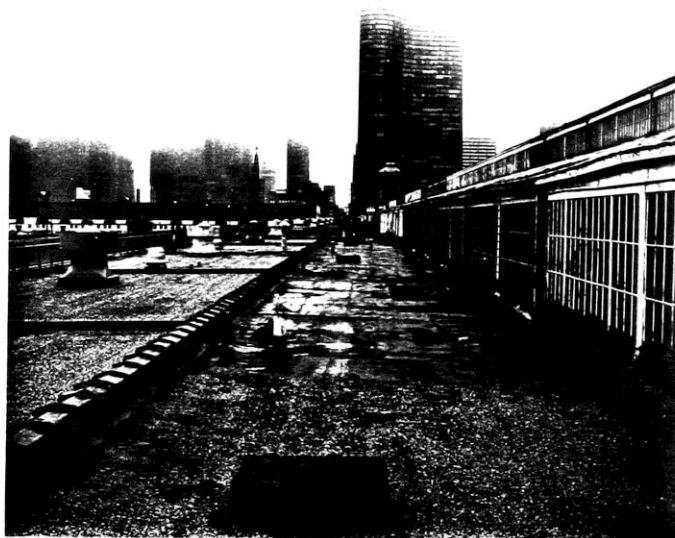
Navy Pier, Chicago, Illinois One of 3 microphone installation sites for "City-Links", Chicago 1974 and "Everything-in-Air": installation-performances, Museum of Contemporary Art, Chicago, Illinois, May 10, 11, 1974